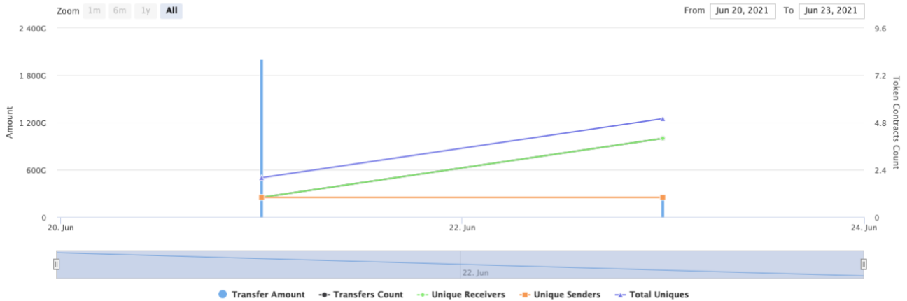
Token Contract 0x27d22cf87289bbc1f0a4661e7dc468731ca6bdca (WHITE RHINO TOKEN)